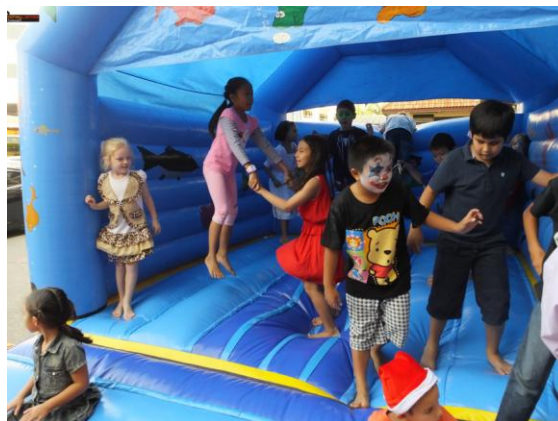
At the jolly kids Christmas event, the kids got free entrance, complementary food and drink and a gift from Santa; and they were entertained with face painting.