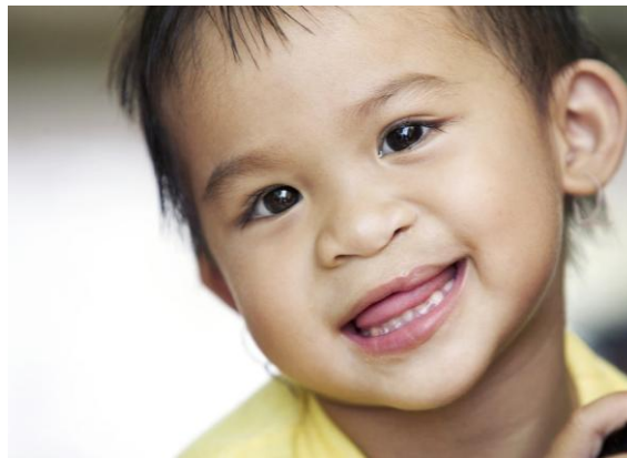
TFi donated funds to Operation Smile to help children born with facial deformities.