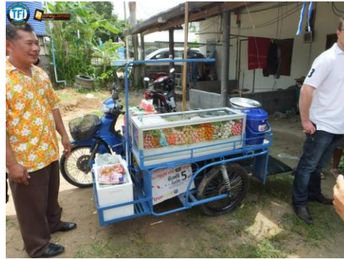
TFi teamed up with Pattaya Sports Club to rebuild this man's sidecar.